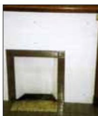
Asbestos insulating board (AIB) fire surround