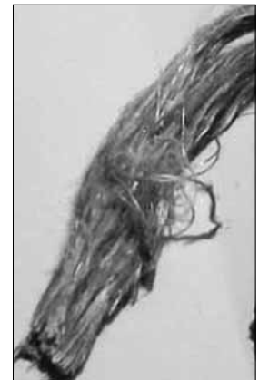
There are three 'colours' of asbestos, but you can't tell just by the colour what you have found; it could be mixed with other ingredients which change the appearance.