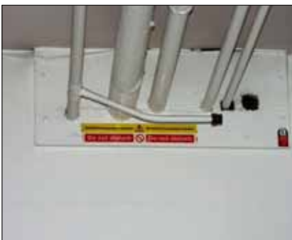
Don't assume there will always be warning signs. There could be undiscovered asbestos in buildings you work on.