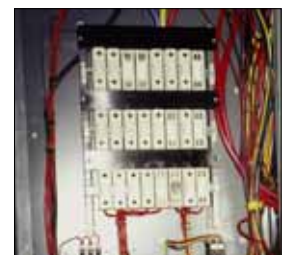
Asbestos isn't always obvious. Would you spot an asbestos gasket on an old engine, asbestos cement pipes or an asbestos-containing fuse-board? If you're not sure, the premises owner needs to get it checked out!