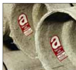
These asbestos cement pipes are labelled, so are the tiles, but you might not know until you start to lift them.