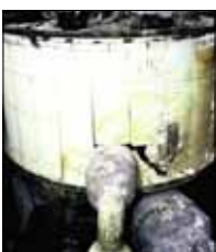
Asbestos lagging on an old tank