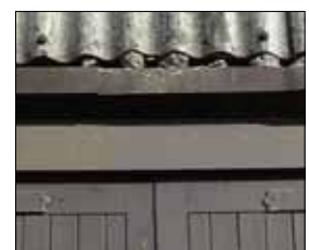
There could be sprayed limpet under this asbestos cement (AC) sheeting